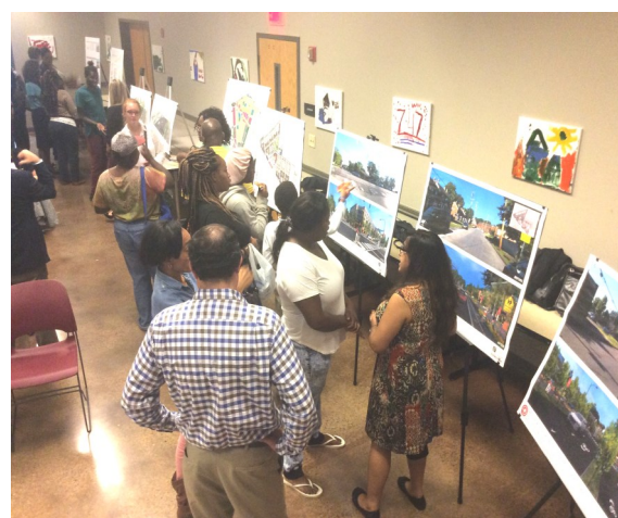
Neighborhood Charrette on September 14, 2017