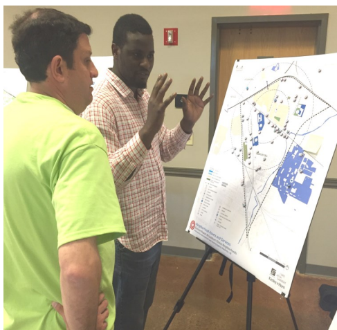
Street Fest Charrette on May 13, 2017

Next Steps: Finalize goals and strategies related to crime, education, employment and health and well-being; evaluate partnerships to assist with implementation; and start evaluating a potential phasing plan.