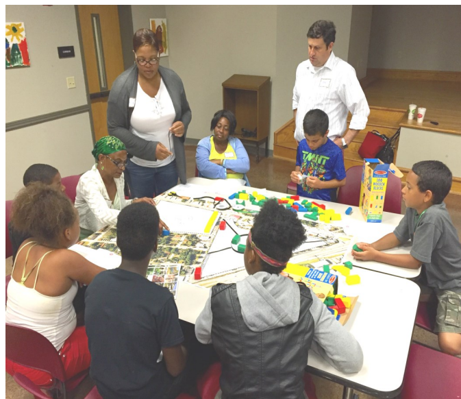
Child Focused Charrette on June 15, 2017

Next Steps: Finalize goals and strategies related to crime, education, employment and health and well-being; evaluate partnerships to assist with implementation; and start evaluating a potential phasing plan.