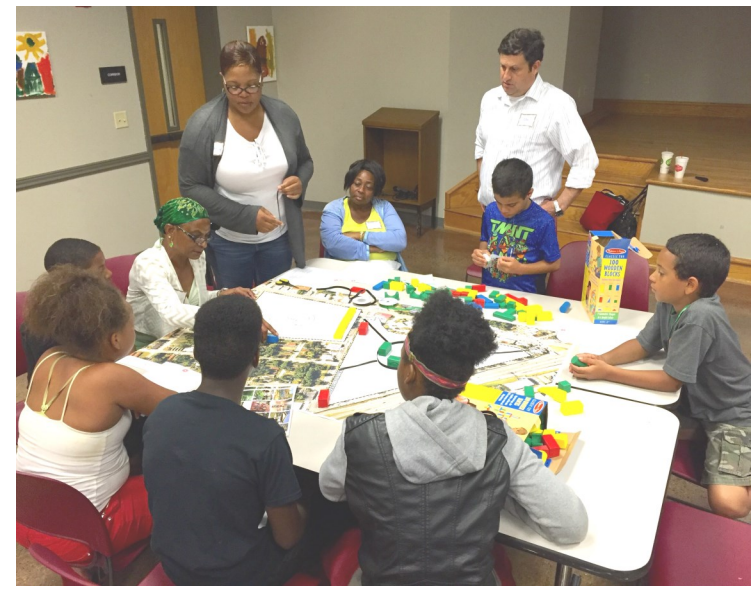
Child-Focused Charrette on June 15, 2017