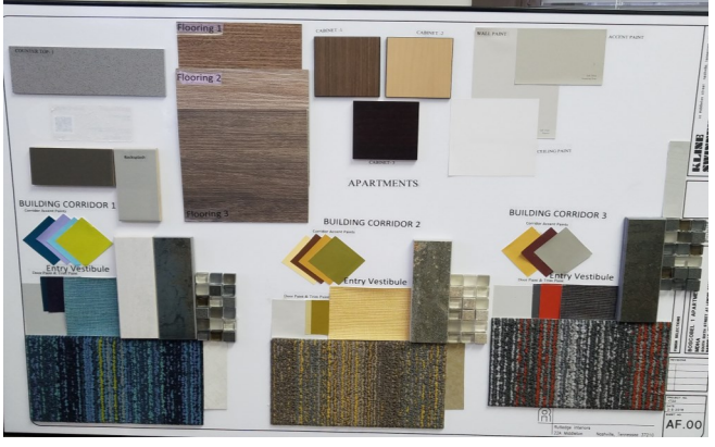
Interior finishes for Boscobel I