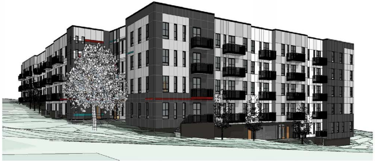
7 th and Dew Street Corner Perspective