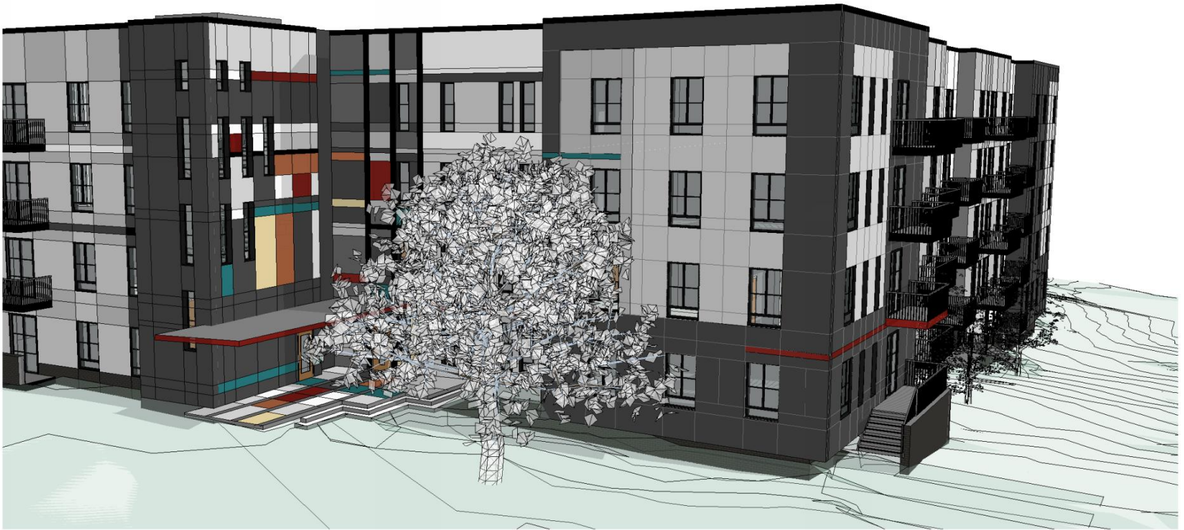
Entry Corner Perspective